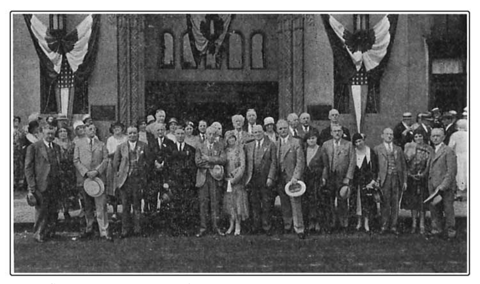
OFFICERS, MEMBERS AND GUESTS OF THE AMERICAN DRUGGISTS' FIRE INSURANCE COMPANY.

on the part of those who are unfamiliar with its responsibilities. Do not let the scoffer disturb you, for he is, after all, not a constructive member of society. See to it, however, that the earnest and constructive members of society, whose views go far in the molding of public opinion, obtain a true picture of your professional activities. The method which you will pursue in attaining this end will determine to a large extent your own personal standing, as well as the standing of your profession in your community."